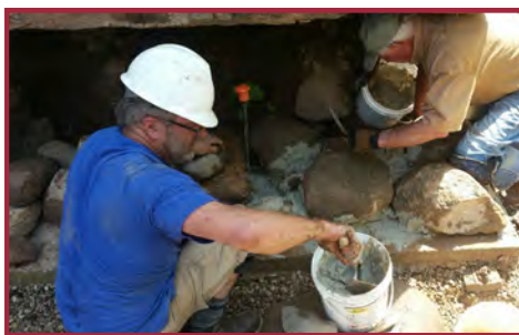
Let the stone work begin.