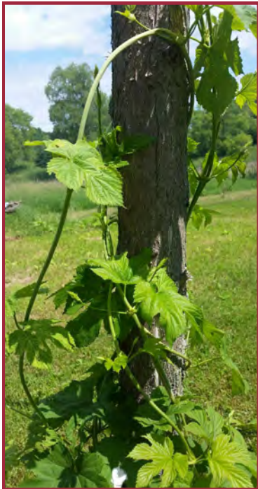
Heirloom Hops are planted to showcase the 1870s German style.