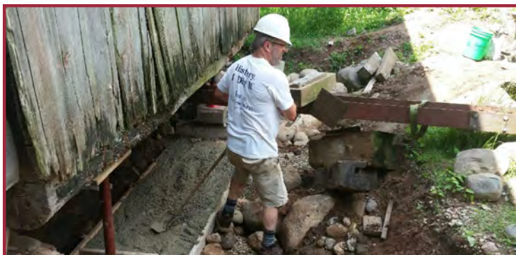
Stone masonry is like fitting pieces of a puzzle together. Every stone must be washed.