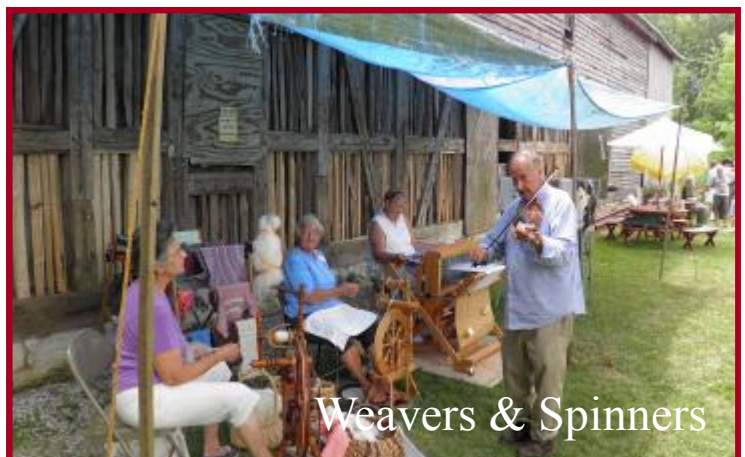
Weavers & Spinners