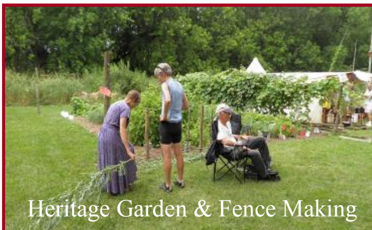
Heritage Garden & Fence Making