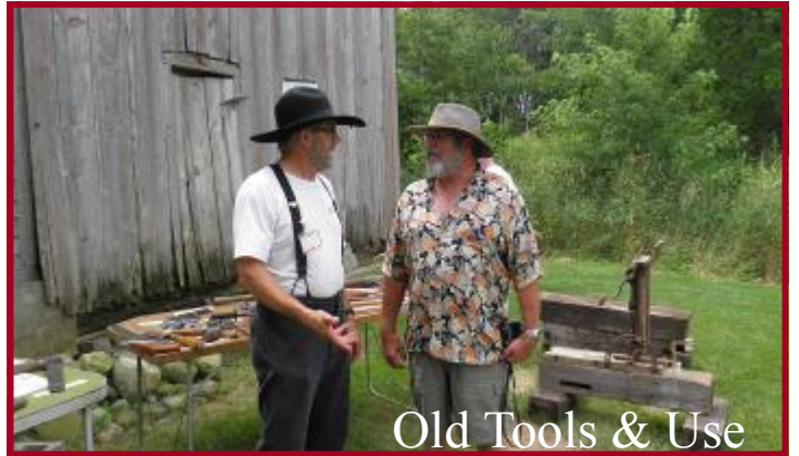
Old Tools & Use