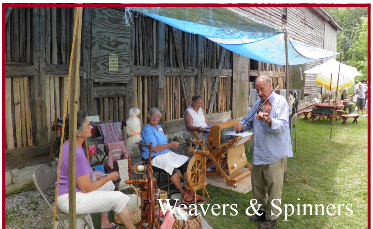
Weavers & Spinners