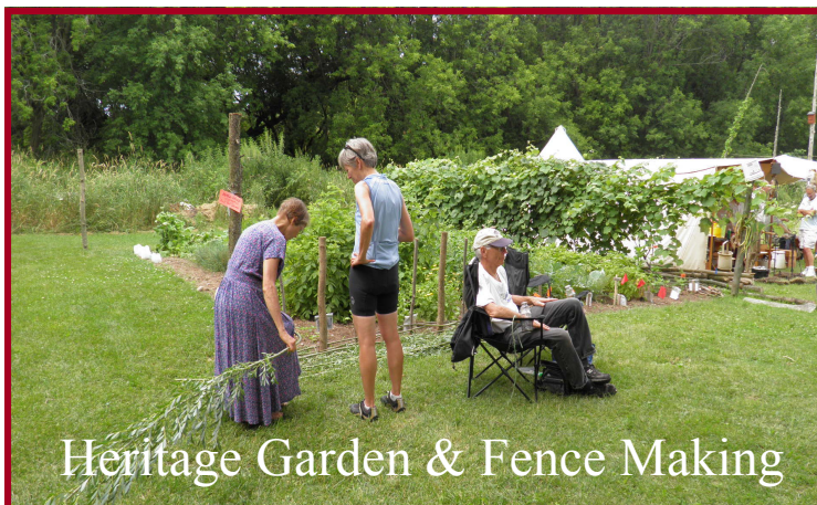
Heritage Garden & Fence Making