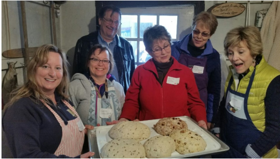
Sourdough bread baking participants show off their creativity!

Hands-On Timber framing skills using old-time tools are a part of the educational process at the work days at the Lutze Housebarn.