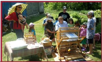
Open House Events are held with demonstrations of old time skills common in the 1800's.