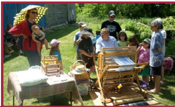
Open House Events are held with demonstrations of old time skills common in the 1800's..