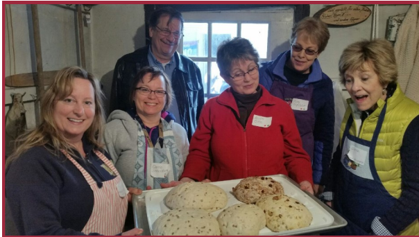
Sourdough bread baking participants show off their creativity!

Hands-On Timber framing skills using old-time tools are a part of the educational process at the work days at the Lutze Housebarn